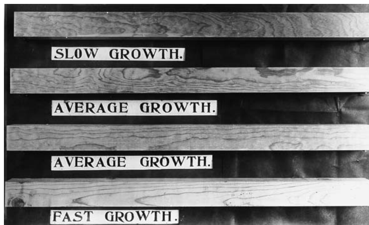
FIG. 2 Tangential Surfaces of Bending Specimens of Different Rates of Growth of Jeffrey Pine 2 by 2-in. (50 by 50 by 760-mm) Specimens

moisture content will not occur. To prevent such changes, it is desirable that the testing room and rooms for preparation of test specimens have some means of humidity control.